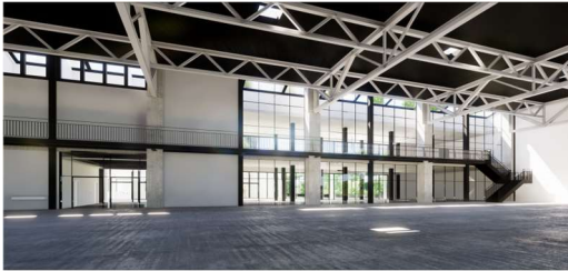
Architektur-Visualisierung, Wandelfähige Fertigungshalle

Das Bildmaterial zum Download finden Sie unter folgendem Link: